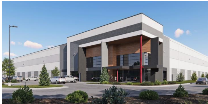
Artistic rendering of the completed complex